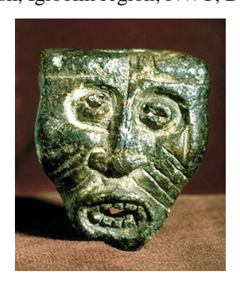
Picture 2: Miniature Mask Soapstone miniature mask, Igloolik region, NWT, Dorset Culture.<sup>49</sup>

The Dorset culture suddenly disappeared and according to oral Inuit history they fled from new comers from northern Alaska, the Thule people. Thule culture began to influence the Canadian Arctic after 1000 AD and reached eastern Greenland by 1200 AD. This culture seems to have been the most uniform of the Eskimoan cultures (covering the entire Arctic of the western hemisphere, including an eastern tip of Siberia) which gave the Eskimos the appearance of homogeneity for a long time. Nevertheless this opinion was revised by the new generation of archeologists and is only true for Thule culture artifacts. <sup>50</sup>