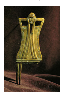
Picture 3: Comb Walrus tusk comb, Pelly Bay region, NWT, Thule culture.<sup>52</sup>

The demise of the Thule culture and the arrival of Europeans in the 16<sup>th</sup> century marked the transition from a purely Inuit centered art production to the trade production. This historical period of the Inuit art, before the art objects changed from decorative tools and shamanistic amulets to a trade commodity, lasted till 1940s.